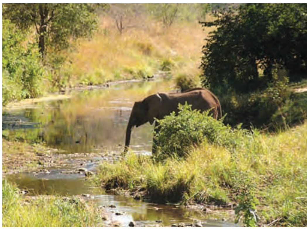
The Dimbangombe River has been restored by livestock on holistic planned grazing over its watershed and along its banks. Elephants now drink in new pools a mile above their traditional water hole, due to a healthier river system.

I have always been passionate about Africa's wildlife and people. Our cattle/goat herd is run without fencing that is so damaging to wildlife, which needs to move freely. The livestock are herded daily to a carefully managed grazing plan that integrates their moves with the sable antelope, buffalo, elephant, waterbuck, kudu, bushbuck and zebra. And because we protect and need the predators—lions, cheetahs, leopards, wild dogs and hyenas—the management herd sleeps securely at night in portable lion-proof corrals sur-