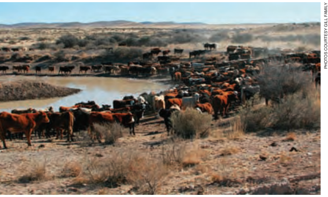
About one-third of the Circle Ranch herd at water. Allan Savory told Chris, "To grow plants on hard, bare soil, one does not simpy rest it and hope! Break the soil surface to let water and seeds in, and cover soil with plant litter and manure to provide a seedbed. This gets plants growing. It improves the soil's ability to absorb and store rainfall to grow more plant life. This in turn supports more animal life in an ever-widening circle."

Our ranch is in a very erratic rainfall area, so we needed to plan continually for droughts. Allan explained that most ranchers