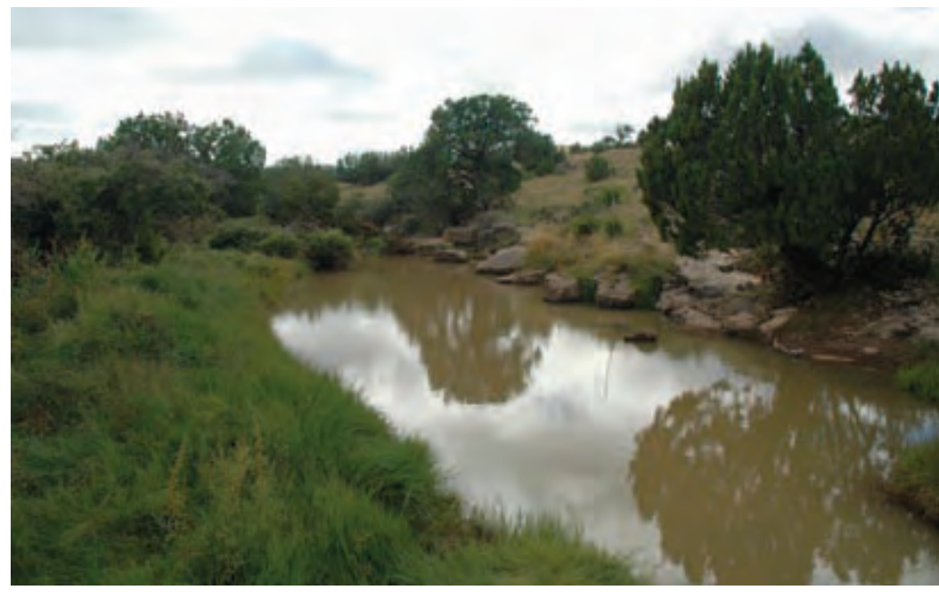
A "tinaja" (seasonal water hole) showing regrowth typical of planned grazing intense/brief animal impact. "We have excellent records of what we have done," Chris says. "Based on regular monitoring and measurement, our land has improved through planned grazing, increasing our livestock 400 percent and our densities sometimes 250 times. Forage taken has tripled. Our problem is getting the increased grass eaten."

Curious whether this was deliberate misrepresentation, I contacted Savory and asked about it. He pointed out that new discoveries