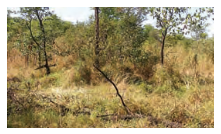
Same land in 2009 (note bent-over lower branch of tree on the left). Erosion has stopped. Vastly more feed and cover for wildlife has grown and more water and carbon are being absorbed into healthy soil. Using holistic management, amazing recovery takes place.