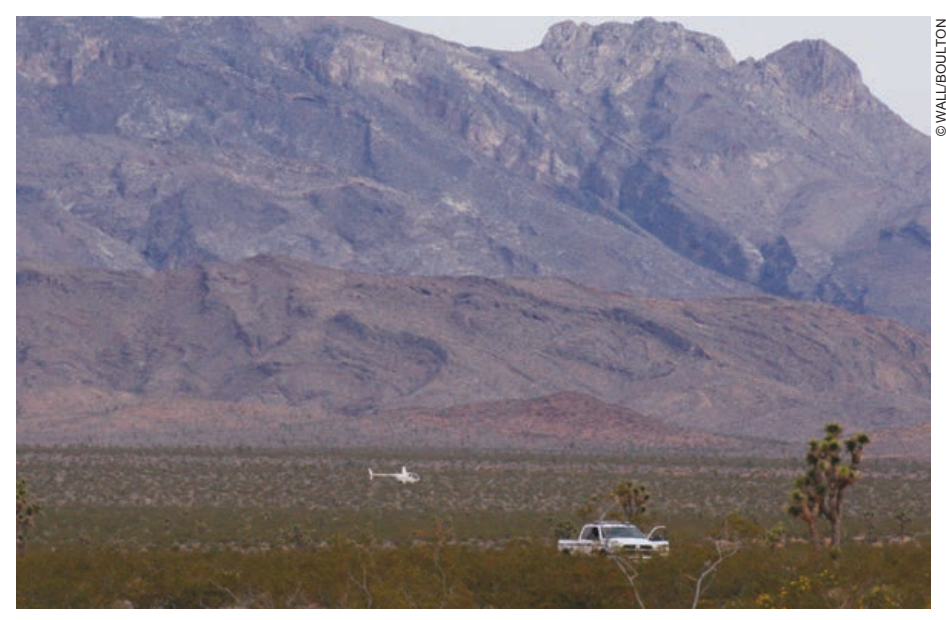
The BLM's hired contractors—"cowboys from Utah"—and its own employees cost Bundy "at least $100,000" in infrastructure damage and "more than 50 head of cattle."

Bundys were giving the calf water as it lay in the shade in their front yard, and by the end of the day the little critter could at least raise its head...but it died the next day. In late June, Bundy told me his losses were "at least $100,000" in infrastructure damage and "more than 50 head."