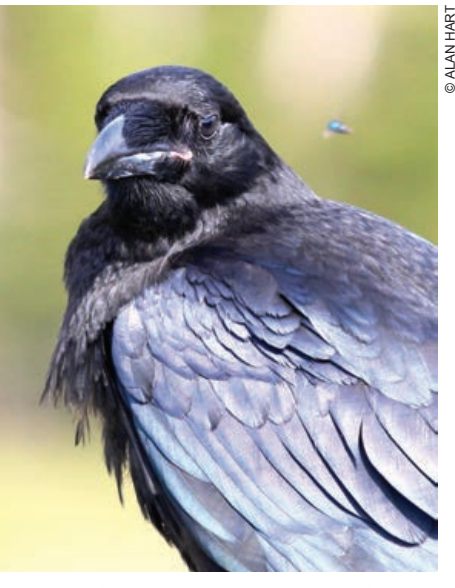
Even though there are millions of ravens, they are protected by the Migratory Bird Act. Sadly, ravens are the greatest threat to desert tortoise, eating baby tortoises right out of their shells.

The BLM was established in 1946 to "promote productive use of the land." In 1990, 596 species were listed as "threatened or endangered" by the federal government. By 1999, the list had grown to 1,205—many of them weeds and bugs.