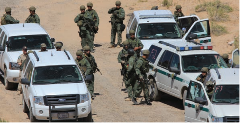
Would you believe this is what folks in Washington now believe representatives of a bureau established to "sustain the health, diversity, and productivity of the public lands" should look like? Actually, given the lack of shoulder patches, there's no way to be sure which agencies are represented among these combat troops, seen deploying near Toquop Wash on April 12 to guard cattle seized from the Bundys in an effort to reduce "productivity" of that land to zero. Bundy and members of Congress insist the BLM has "no police powers."

Bundy's 600 head of cattle and remove them from land about 80 miles northeast of Las Vegas which his family has been grazing for more than a century. Or its goal might have been to lure Bundy into an armed response to men bulldozing his waterlines, torching his water tanks, and shooting his bulls. If he'd responded that way, they could have jailed or killed him to serve as an example to other ranchers elsewhere in the West who might be tempted to similarly resist the bankruptcy which looms for all as the BLM continues to annually reduce the number of cattle they're allowed to graze.