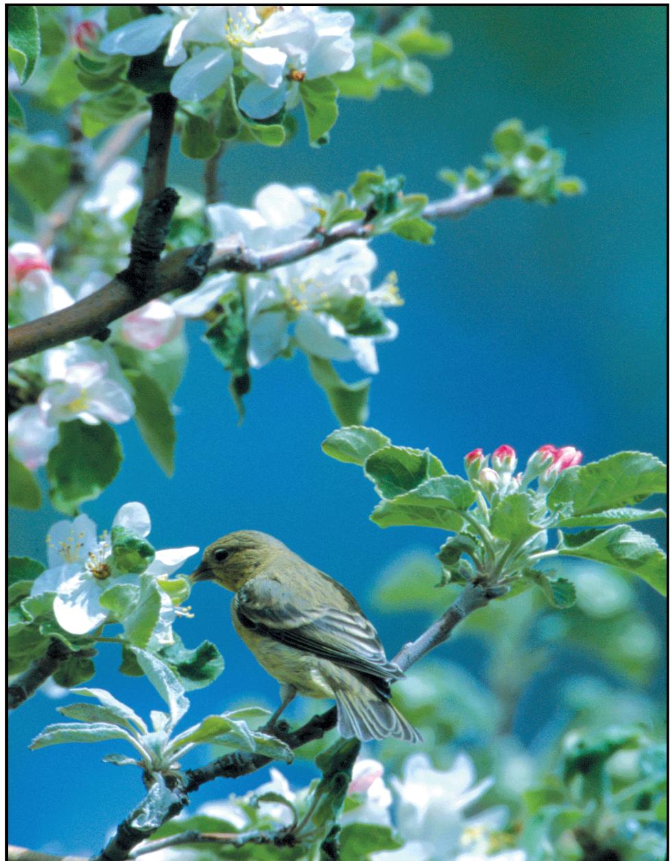
A young goldfinch pauses in its hunt for seeds to enjoy the fragrant blossoms on a Nevada apple tree.

More of Cynthia A. Delaney's work can be seen at www.cynthiadelaney.com