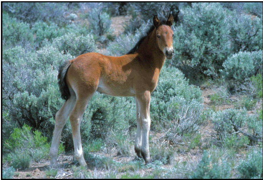
This mustang colt in northwestern Nevada watches the photographer with keen interest.