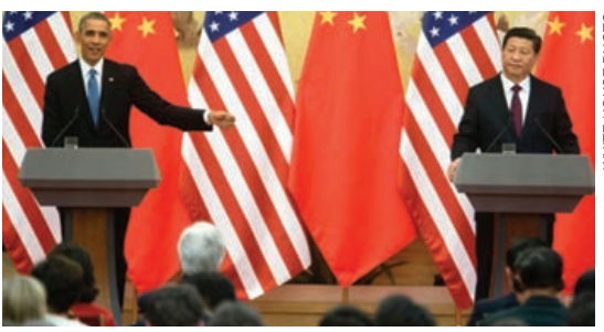
President Obama and Chinese Pesident Xi Jinping announce their climate-change agreement in which the U.S. must reduce its CO2 emissions to 26-28 percent below 2005 levels by 2025, while China gets to continue increasing emissions until 2030, and then only level them off. It is a terrible agreement.

On the final day of the U.N. Conference of the Parties in Peru, India warned that it would not agree to any treaty that undermines its economic growth and fight against poverty. Even earlier, the day after Obama's attack on Abbott, Germany had announced it was withdrawing from its binding 2020 emission reduction goals. It is building dozens of new coal-fired generation plants and there is no way it could meet its agreed-to goals. In 2013 Germany imported a record 51 million tonnes of coal to feed its new coal-fired generating plants.