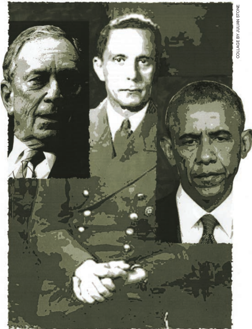
COLLAGE BY JULIAN STONE