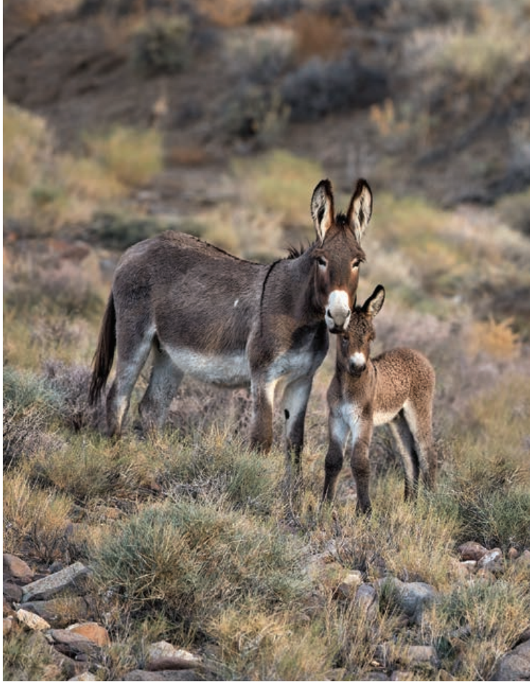
Mama burro and her sweet curly-top baby enjoy a day in the desert hills. Mineral County, Nevada.