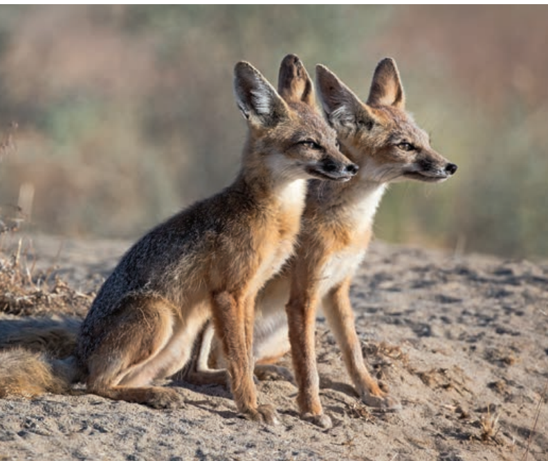
Alone at last, a kit fox pair enjoys a quiet moment together while the pups sleep in. Sound familiar? Lyon County, Nevada.