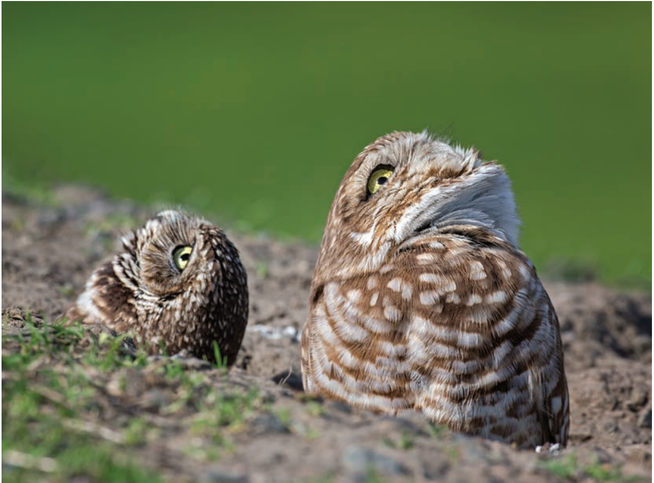
Is it a bird or a plane? Comical burrowing owls scan the skies together. Solano County, California.