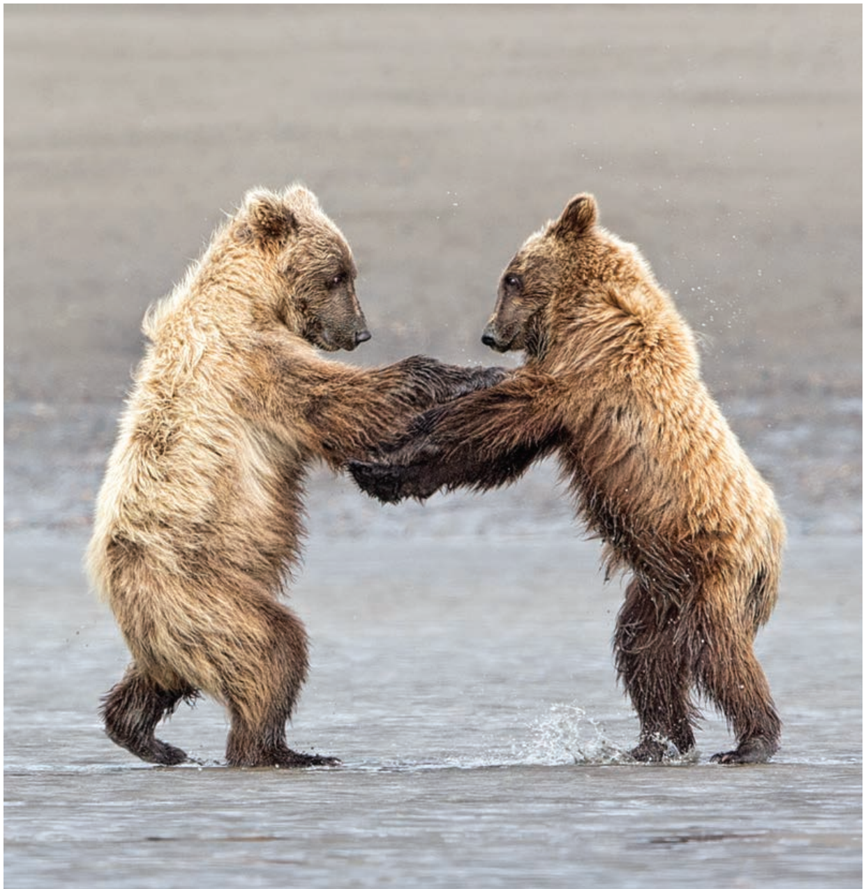
Two left feet? No way, as two grizzly cub siblings keep in step on the beach. Dancing music provided by Ocean Waves. Cooke Inlet, Alaska.

LOTS OF THINGS COME IN PAIRS – SHOES, PANTS, SCISSORS, GLASSES, PLYERS AND ACES. CRITTERS? THEY EITHER COME IN HERDS, GAGGLES, PACKS, WARRENS, FLOCKS AND OTHER SOCIAL GATHERINGS OR ARE STRICTLY LONERS. SO JUST A COUPLE IS SOMETHING TO TAKE NOTE OF AND TENDS TO BE PRETTY DARN CUTE.