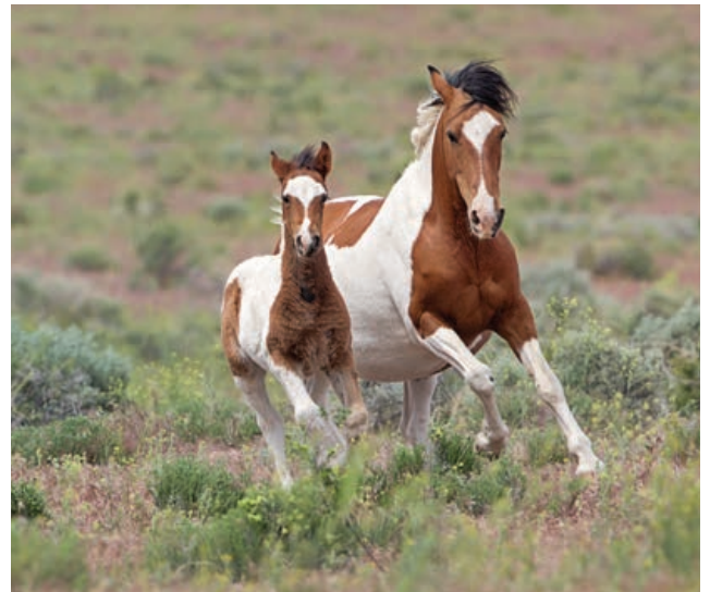
Wait, am I seeing double? A young colt, the mirror image of his mom, runs in synch with her through the sagebrush. Lyon County, Nevada.