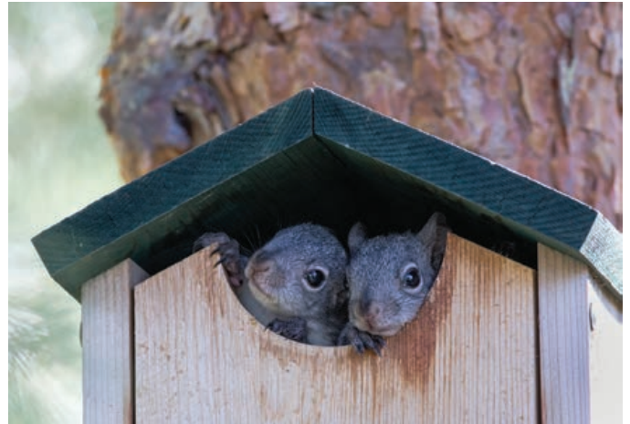
Baby California gray squirrels, looking quite adorable, wait for Mom. There are more babies inside, but these two made it to the lookout tower first. Reno, Nevada.