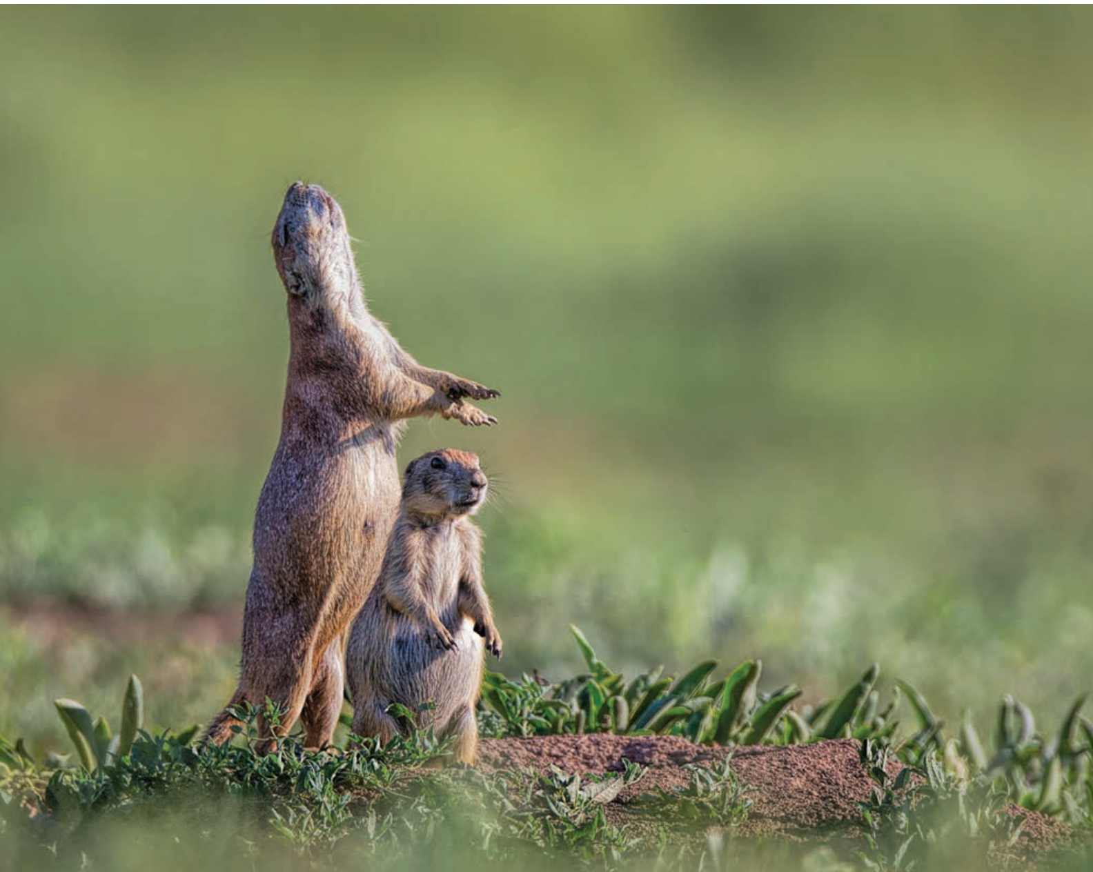
Black-tailed prairie dogs greet the morning sun with some warm-up yoga stretches. Rocky Mountains, Colorado.