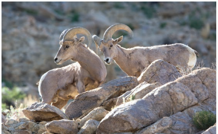
Acting a bit giddy, like on prom night, bighorn sheep rams eagerly wait and watch as the ewes begin to arrive. Mineral County, Nevada.