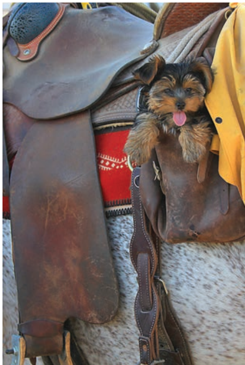
Tagalong little doggie on the Hideout Ranch near Shell, Wyoming.