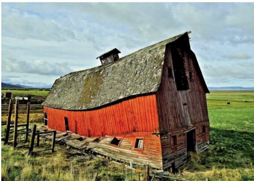
Going down—too many hard winters south of Lakeview, Oregon.