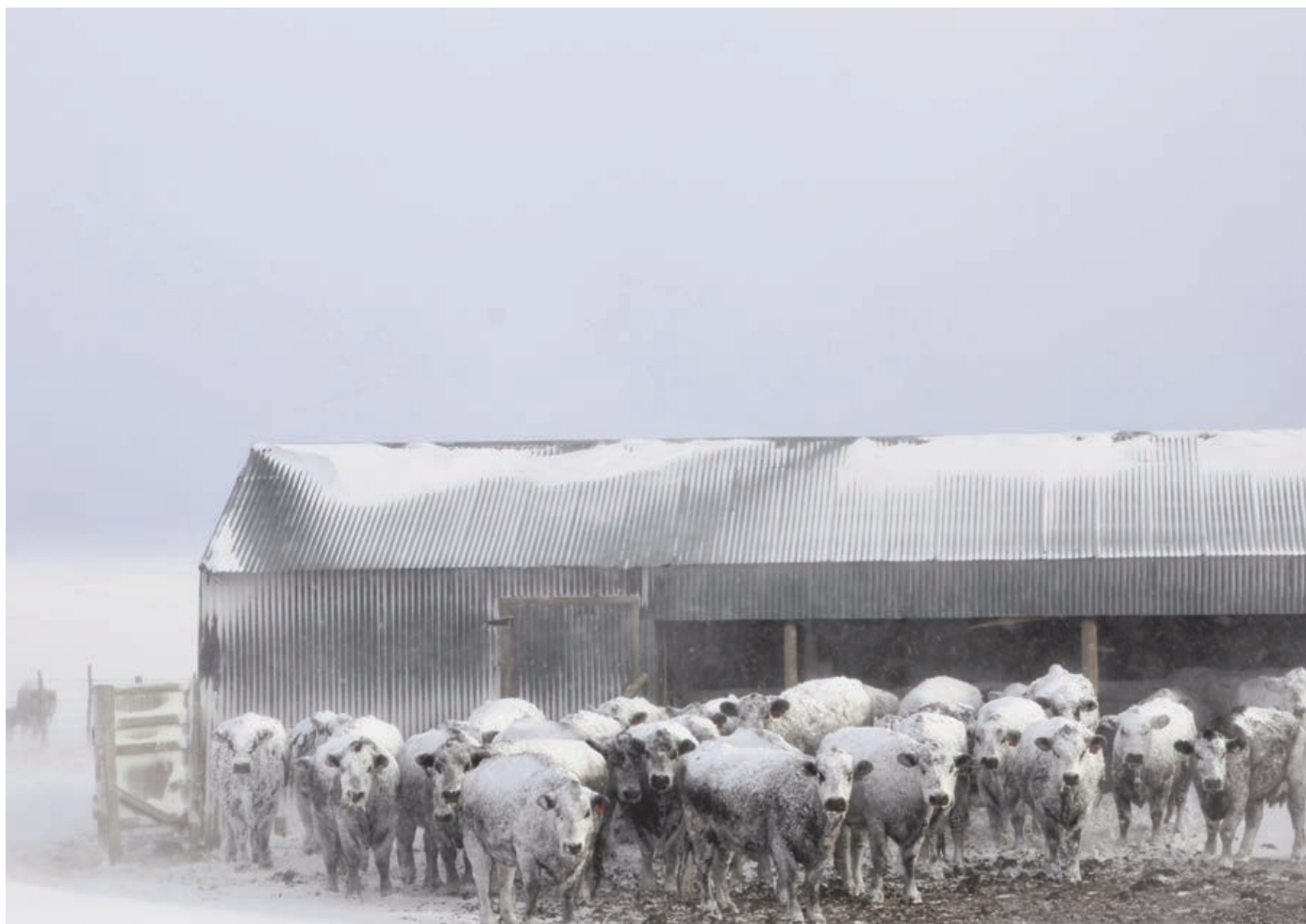
Ghost cows in a blizzard at the Palo Blanco Ranch in Colfax County, New Mexico.