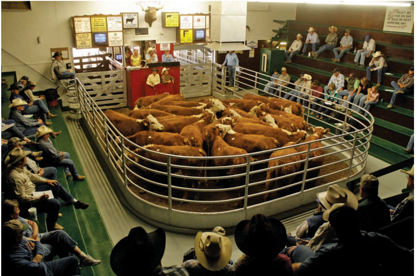
Payday, La Junta Livestock Commission Company, La Junta, Colorado.