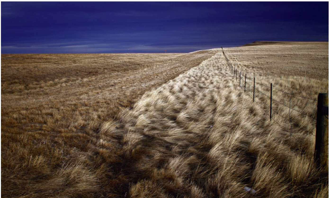
Montana prairie in the wind taken near Simms, Montana.