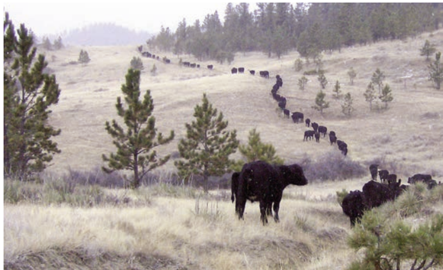
Trailing home to Castle Rock Ranch, Powder River County, Montana.