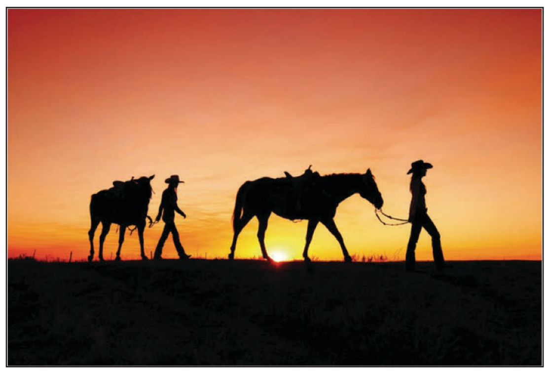
"Kinship" by Todd Klassy

(Entries were for Summer 2021 "Kinship," Fall 2021 "Small Towns," Winter 2021/2022 "The Perfect Catch," and Spring 2022 "Rural Churches."