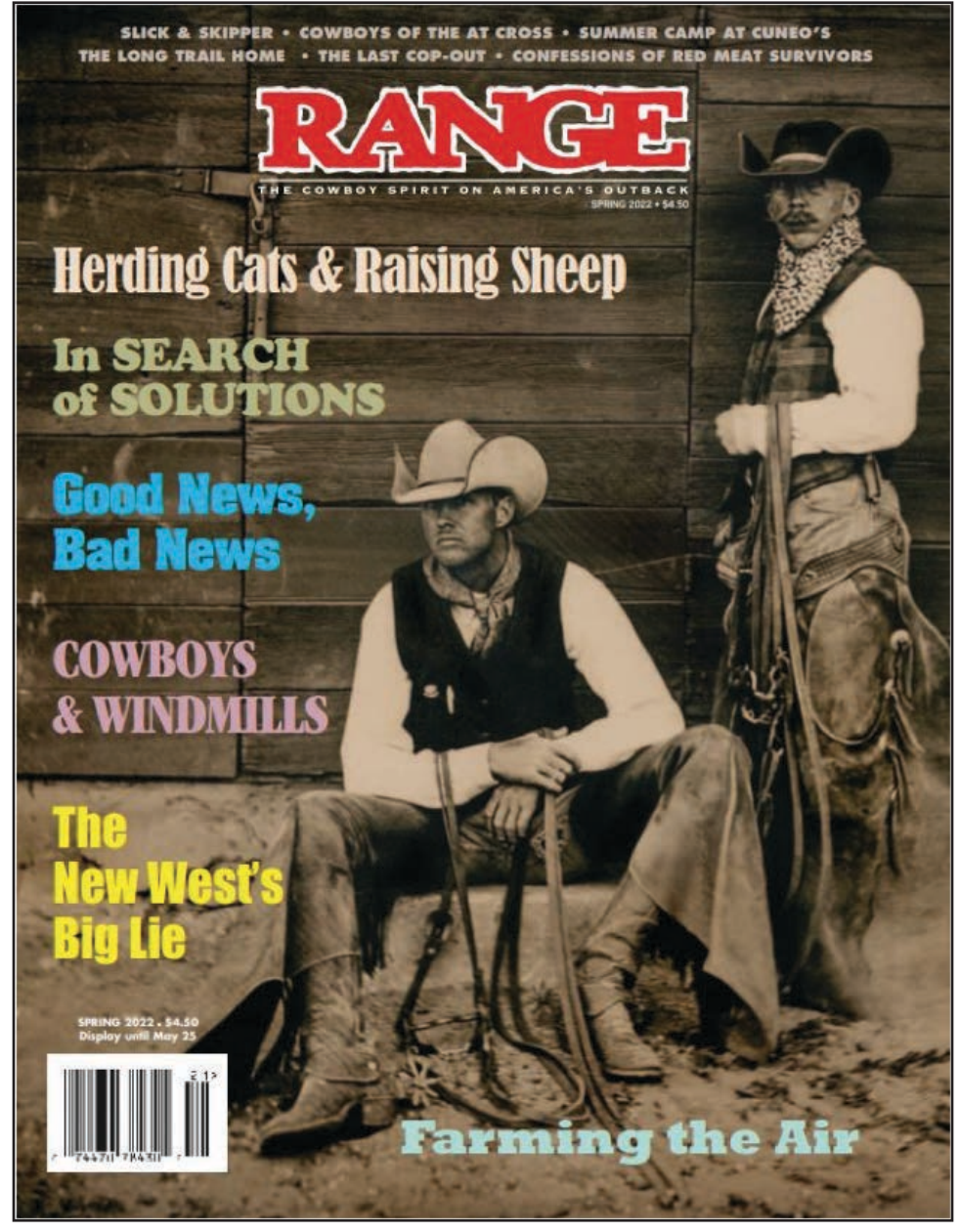
Texas Cow Punchers, Cover by Robb Kendrick

Judge's Comment: "Good composition, cropped well for magazine cover, slight out of focus feel makes it look like an old-time photo. Very nice touch."