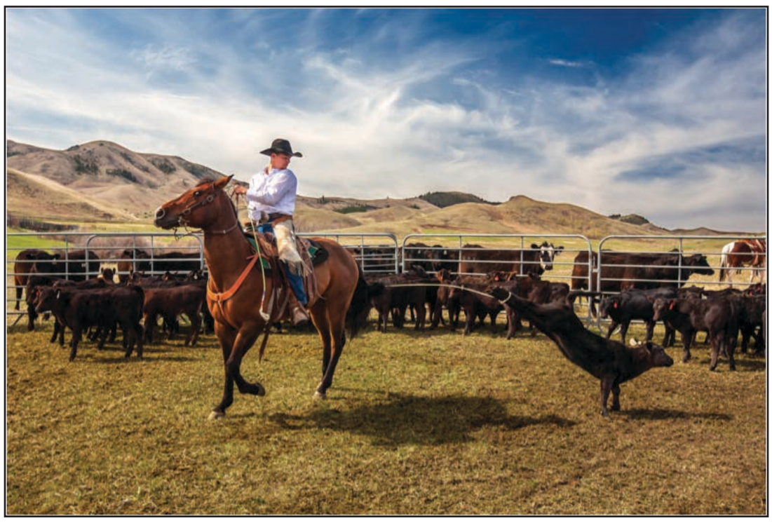
"The Perfect Catch" by Todd Klassy