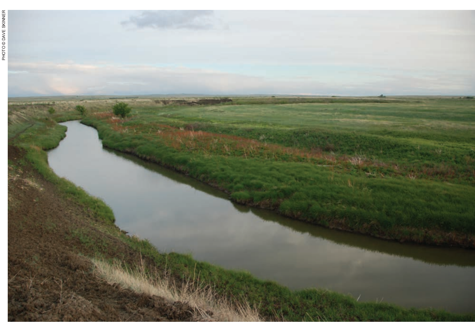
Environmentalists will only be happy when this scene of Beaver Creek near Content includes wild, free-roaming buffalo. But locals are happy with the way things are. As Nancy Ereaux puts it, "Please, please, leave us alone."

hunt. "We aim to please. If someone buys a tag and, for example, wants to hunt in fringe buckskin with black powder, we'll set them up." Bow hunting is especially popular. Azure explains that the experience is "like stepping back in time 200 years."