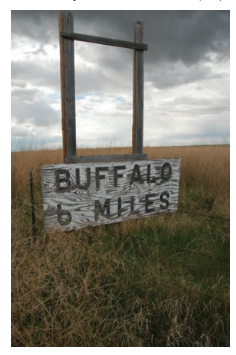
This derelict sign west of Wolf Point hints that somebody tried to attract "buffalo viewing" tourists on U.S. Hwy. 2, without much success.

The high ground held little to no yearround water until retention dams were put in upon settlement. No dams, no wildlife. Then there is active vegetation management: "We build hunting and wildlife habitat every day,"