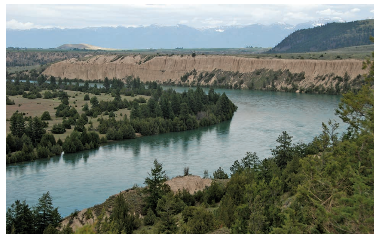
Below Kerr Dam, the Flathead River runs high and cold with spring runoff on its way to join the Clark Fork. To the far east are the Mission Mountains, while Round Butte, rear left, stands in the western part of the main Mission Valley. The facing bank gives an idea of how much rich glacial silt was left behind by Lake Missoula in the last ice age, and how high all that fertile ground sits above the water that makes it all work.