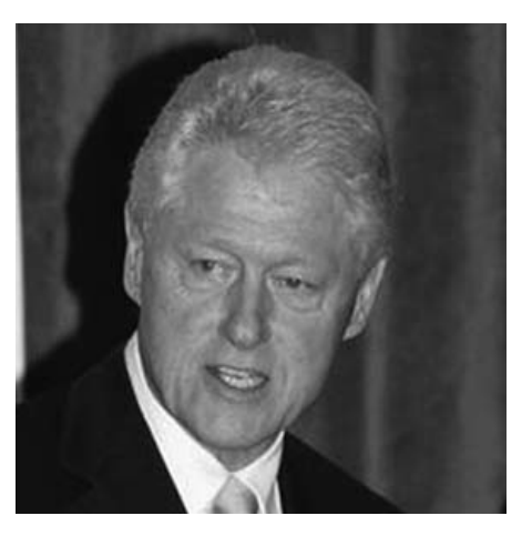
Bill Clinton stopped real production in Utah.

Since the early 1970s, there has been a well-orchestrated plan to implement "ecospiritual" management of the environment through coordination between federal landbased agencies like the FS and BLM, U.N. agencies, and environmental groups (aka NGOs or nongovernment organizations).