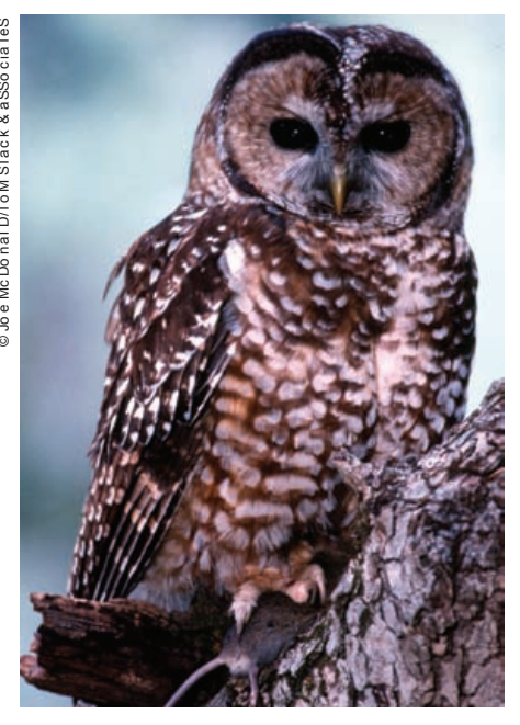
The spotted-owl controversy in the 1990s caused the eventual closing of hundreds of sawmills and the loss of tens of thousands of jobs.

President Obama is now considering three or more national monuments using the Antiquities Act containing over 13 million acres in 11 western states. He also directed the BLM in December 2010 to review 200 million acres of its land for inclusion into what is called "wildlands." (See "Where the Wild Lands Are" by Dave Skinner, Summer 2011.) The problem with national monuments and wildlands is that it is a backdoor way to lock up federal lands from use. Clinton's designation of the Grand Staircase-Escalante National Monument locked up the