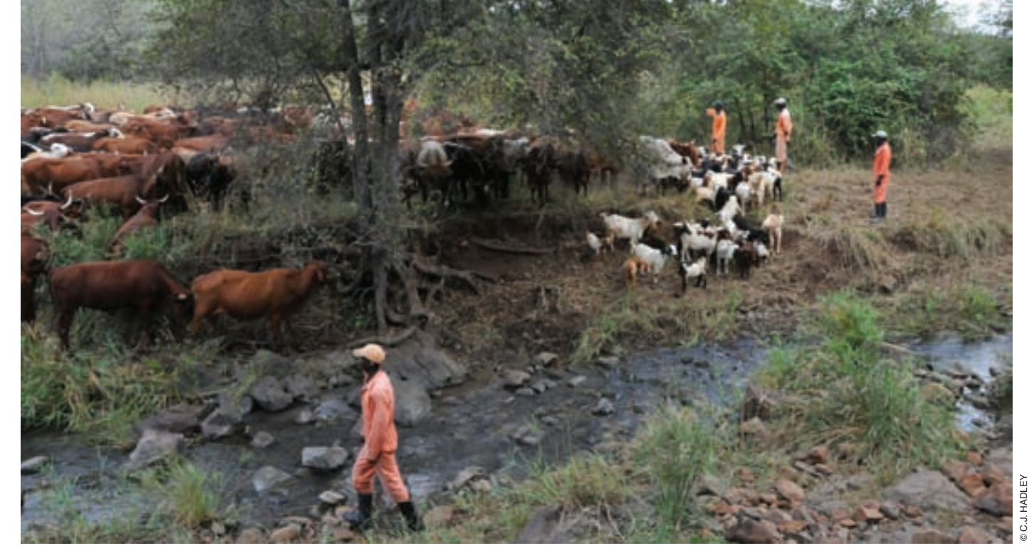
Dimbangombe herders move the land management herd along the river to create the desired riparian habitat for wildlife. This treatment is repeated when necessary, usually after months of recovery for grazed plants. Small stock like goats generally graze to one side of the main herd of cattle.

tic Management and its holistic planned grazing at almost no expense and to the benefit of people, the economy, the environment and wildlife.