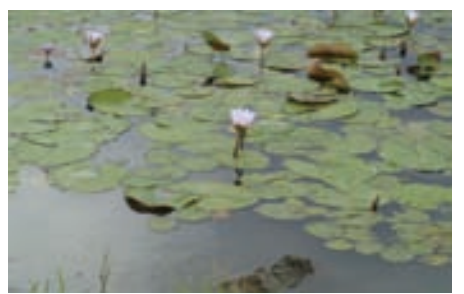
Permanent water where not known in living memory at end of long dry season is entirely due to increased cattle and goats properly managed.

The American West and its cattlemen with their rich culture as well as government