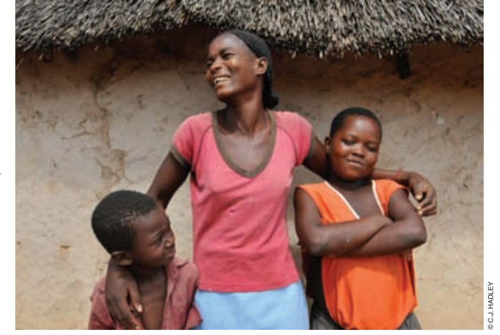
ABOVE: Woman and sons at the employees compound at Dimbangombe Ranch. It consists of mostly mud huts and a couple of taps offering community water. Water heating and cooking is done on open fires under a thatch roof. The Centre is building new ablution huts for showers. Its goal is to have a tap beside every home. "Most African men have two or three wives; one guy had 11 wives and 57 children," a farmer says. "Having children is a badge of honor. They live off very little, grow some crops. Half the country is HIV-positive." BELOW: Impala at a water hole, with a kudu in the middle. They need to get to water daily. Opposite: RANGE publisher C.J. Hadley offers a snack to Dojiwe ("lost orphan"), a tame baby elephant at Dimbangombe Ranch. Her mother was killed and two herders take turns walking with her from sunup to sundown. They kraal her at night to protect her from predators.

By the time he was 26, he had helped damage even more land with his conventional thinking. "We had very, very healthy land with wonderful reed beds and beautiful riparian areas and we made national parks out of those areas. There were people beating drums and firing muzzle-loading guns to keep animals away from their crop beds along the river. This was old Africa with lions roaring at night. More than once in my life I've seen 40 lions in a day just walking on foot. I watched all that deteriorating and still couldn't work out why. I concluded there were too many elephants and buffalo. As soon as we made these healthy places into national parks, immediately the damage began. The reed beds began to disappear. A lot of the vegetation along the river began to disappear. I never blamed weather or drought but attributed it to too many ele-